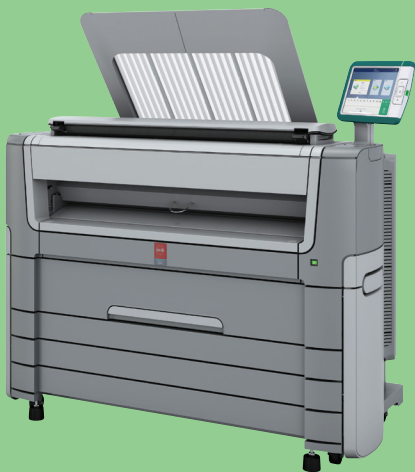
WITH OPTIONAL SCANNER EXPRESS II (MULTIFUNCTION SYSTEM)

Being able to submit files to your large format printer from anywhere can give you a big advantage when time is tight and deadlines are looming. The Océ ClearConnect software suite gives you more flexible ways to submit files to the printer. Print from your desktop via Océ Publisher Select™ software to manage complex document sets. With Océ Publisher Mobile, print from your smartphone or tablet when you are rushing to a meeting. Knowing you can print when you need to, can take some of the stress out of your work day.