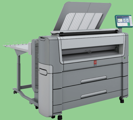
MULTIFUNCTION SYSTEM WITH OPTIONAL OCÉ DELIVERY TRAY AND OPTIONAL MEDIA DRAWER