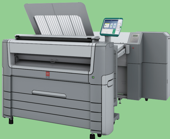
MULTIFUNCTION SYSTEM WITH OPTIONAL OCÉ 4312 FULLFOLD