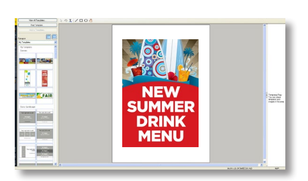
PosterArtist poster creation software

The iPF SE Series is an ideal solution for anyone looking to create eye-popping posters, banners, and infographics. With these types of users in mind, Canon has designed the iPF SE Series to be integrated seamlessly with its PosterArtist Lite software. This easy-to-use software is template-driven and includes predesigned templates, royalty-free images, and clip art. Users can create professional posters, banners, and signage in just four easy steps-for almost any application! A new image correction function for PosterArtist Lite automatically corrects image colors and enables a "cut out" function where selected areas of an image, such as backgrounds, can be removed for enhanced customization. A free version of PosterArtist Lite comes with every iPF8400SE and iPF6400SE printer, and a full version of PosterArtist is available for purchase. The full version includes some added value features such as an expanded library of templates and variable data printing.